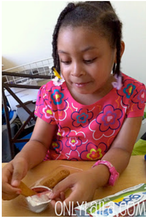
Strawberries are her favorite so she tried those first.