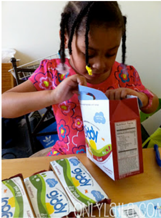
Each container holds 4 snack packs.