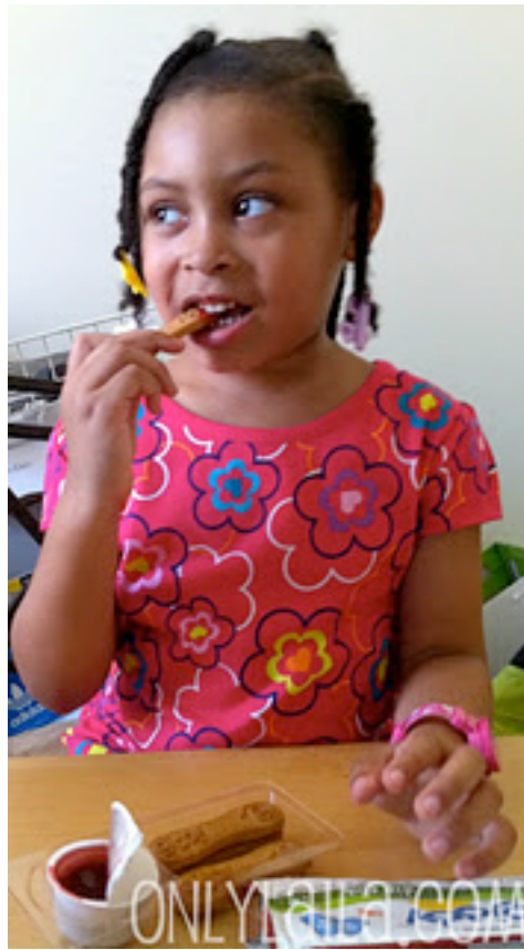
The look of 'Yum!'